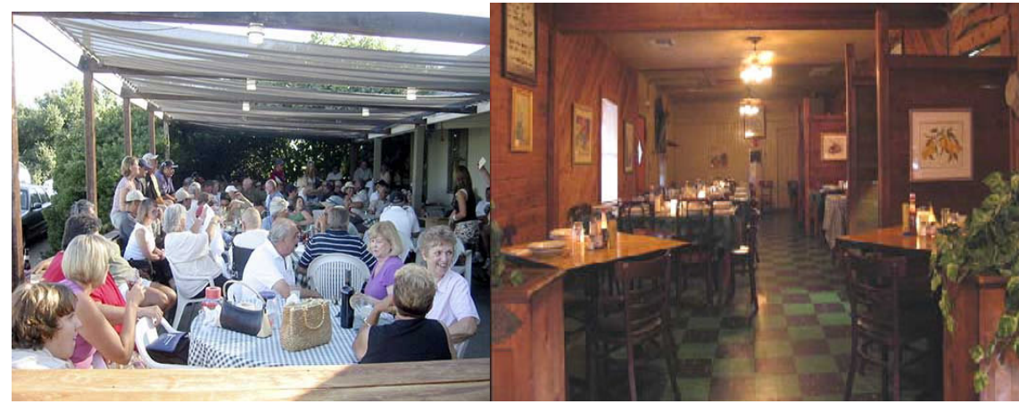
A PEEK of the PAST Use Browser to: giustis.com/html/bar___resturant.html